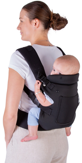
MODE 3 Back Carrier From approximately 4 months

Complies with: BS EN 13209 – 2 : 2015. Suitable from (birth approx 3.5 kg – 15 kg)