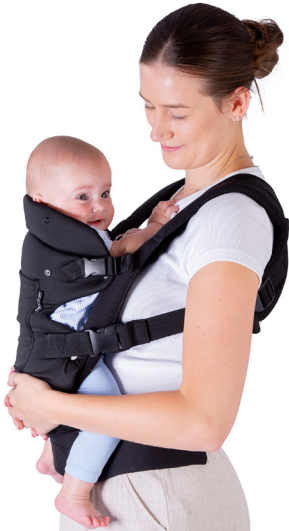
MODE 1 Parent facing (inward) From birth