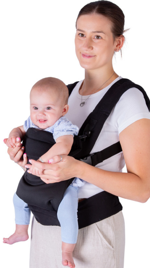
MODE 2 Facing forward (outward) From approximately 4 months